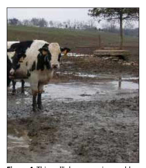
Figure 4. This well's large opening could be hazardous for nearby livestock.

Landowners in Kentucky are responsible for decommissioning abandoned wells within 30 days of deeming them unusable or unneeded. Abandoned wells have clear guidelines for closure under the law (401 KAR 6:310 Section 11), and all of the work needs to be accomplished by a Kentucky certified water well driller.