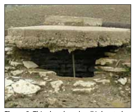
Figure 3. This abandoned well is located in an agricultural area that is void of vegetation that could filter pollutants from stormwater runoff and reduce the amount of pollution entering groundwater resources.

To locate an abandoned well, search old photographs, fire insurance plan drawings, health department records, and water utility records. Also, ask neighbors and former property owners for information. Look for well casings, waterlines, pressure tanks, pumps, and electrical components such as wiring in the yard or basement or near old windmills or pump houses. Metal detectors can help locate metal casings.