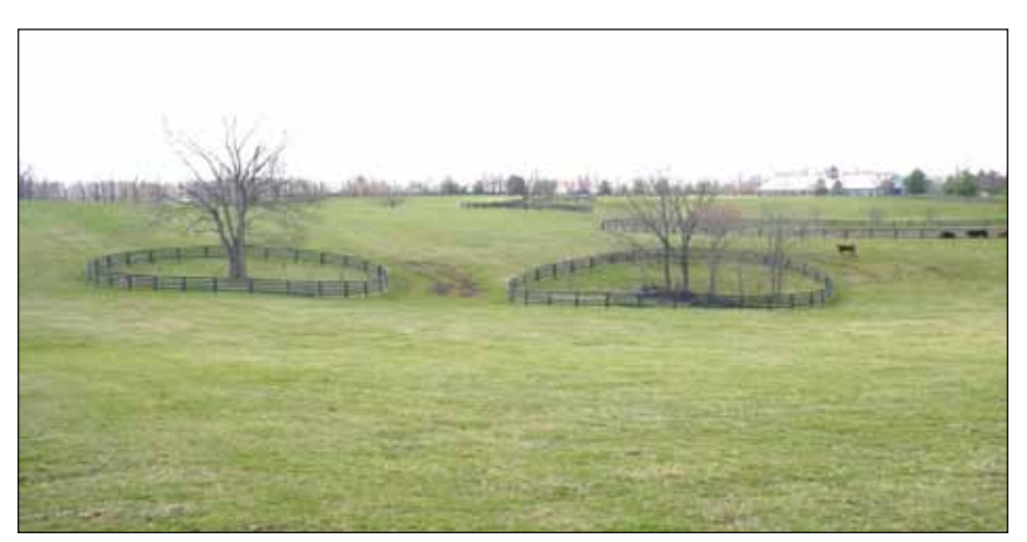
Figure 7. Livestock are excluded from these sinkholes, which protects animals and water quality.

New pesticide and fertilizer storage facilities should be located at least 100 feet from sinkholes, other karst features, and surface water bodies, and chemicals should never be mixed near a sinkhole.