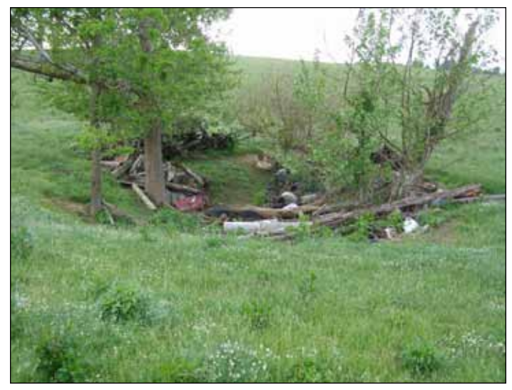
Figure 6. Dumping trash in a sinkhole can pollute ground and surface water.