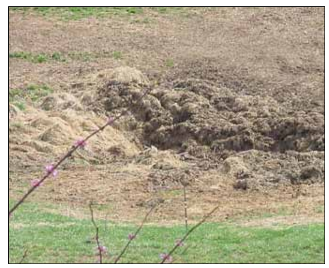
Figure 5. Manure dumped in this sinkhole can contaminate ground and surface water with both pathogens and nutrients.