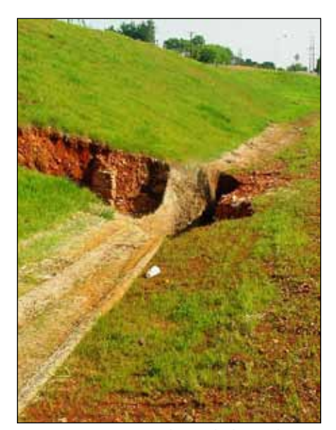
Figure 4. Water was channeled into this sinkhole, causing it to grow deeper and wider.

Disturbances such as soil or water movement near sinkholes can cause them to become unstable, which can result in the sinkhole deepening or widening and in some cases sudden surface collapse. Also, as more water enters a sinkhole, the potential for water resource contamination greatly increases (Figure 4). Landowners should attempt to reduce and/or slow down the water flowing into sinkholes by creating grassed waterways or placing riprap in ditches and gullies leading to sinkholes. In cases where water flows by sheet action, it is best to create a large vegetative buffer. As a last resort, landowners may want to install diversion ditches or grassed waterways that direct water away from the sinkhole, which slows the growth of the sinkhole and lessens the potential for water pollution. However, when diverting water, producers must consider where the runoff will be diverted to ensure that it doesn't cause additional erosion or water quality problems.