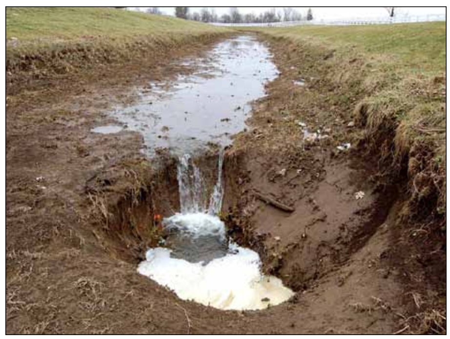
Figure 3. This swallow hole connects the surface stream to the underground water system and does not filter out contaminants, which allows them to enter the system rapidly.

the production area and may already have some vegetation growing around them, but this traditional vegetative buffer can often be expanded or more intensely planted. If it becomes necessary to remove invasive species or toxic plants near sinkholes, use mechanical means or spot applications of herbicides that are considered safe around water sources. Sinkhole buffers in crop areas may require the use of herbicide-ready plants or species that can tolerate the herbicides used on the crops.