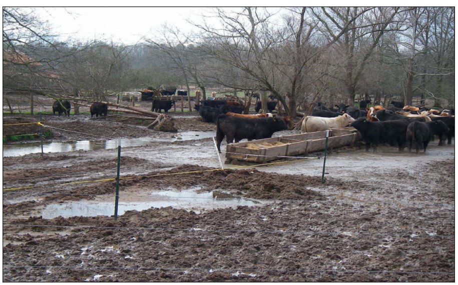
Figure 1. A poorly managed winter feeding area for cattle located along a stream is polluting valuable natural resources.

There are two types of documents used for nutrient management planning: a nutrient management plan (NMP) and a comprehensive nutrient management plan (CNMP). Generally, a comprehensive nutrient management plan is written by a professional other than the producer, is more thorough and detailed, and accounts for all aspects of nutrients on the farm. A nutrient management plan often is written by the producer and is a more basic, hands-on document. At this time, the difference between an NMP and a CNMP is a technical difference between the federal and state agencies requesting and developing the documents; however, the concept behind each document is the same.