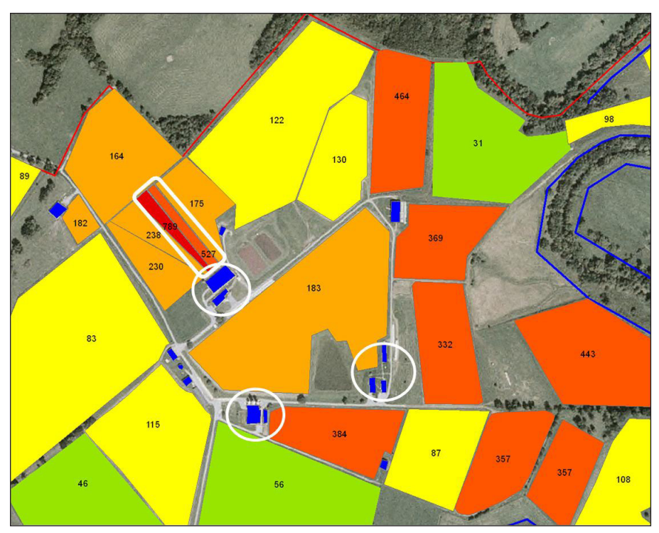
Figure 2. Significant increases in soil test phosphorus have occurred on this livestock operation immediately surrounding the production area (white circles) and accompanying dry lots (white rectangle).

The last calculation in this example showed that the producer would be applying a N:P ratio of approximately 2.1; however, the lowest ratio that a crop requires is 4.1 for corn for grain (Table 4). So if the producer was to calculate the application rate based on nitrogen removal, he would be applying twice as much phosphorus than the crop could remove. This means, under simple assumptions, there would be a build-up of phosphorus in the soil, which can lead to excess phosphorus contaminating ground and surface water resources.